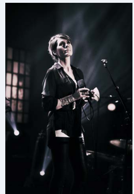
Kari Bremnes > picture download on stage