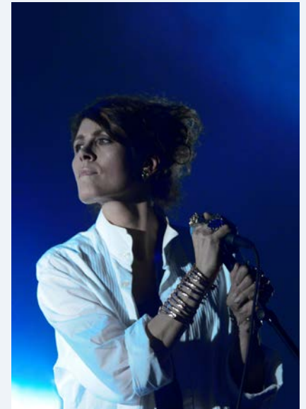
Kari Bremnes on stage

Kari Bremnes: "My own experience is that music has the capability to reach people across the borders."